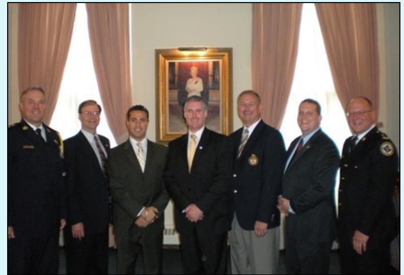
Toronto Country Council Executive Working Group with Canadian Law Enforcement